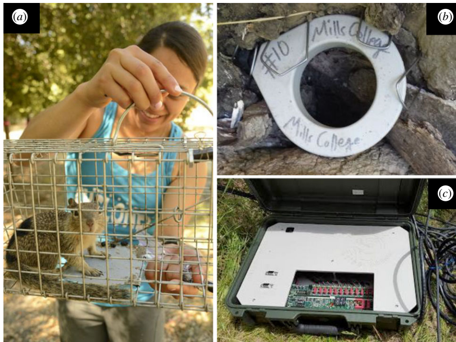
Figure 1. Novel automated-tracking system. (a) Live trapping and release of free-living California ground squirrels allow researchers to provide each individual with a unique fur mark for visual identification during social observations, ear tag for identification during trapping and passive integrated transponder (PIT) tag beneath the skin for detection by the monitoring system. (b) Movements are detected by scanning an individual's PIT tag every time it passed through a secure antenna loop inside of a burrow opening. (c) Data logger (Biomark, Inc., Boise Idaho) records information about the time of day, squirrels' PIT tag ID and burrow location for each movement event. (Online version in colour.)